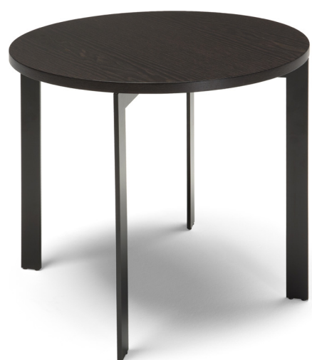
■ T042004XOF / T042004XDD

ALL PICTURES SHOWN ARE FOR ILLUSTRATIVE PURPOSE ONLY. ACTUAL PRODUCT MAY VARY DUE TO PRODUCT ENHANCEMENT.