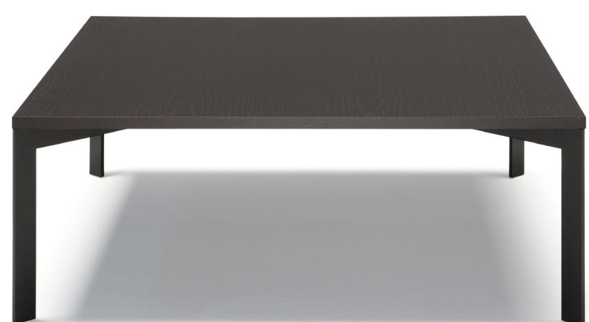
■ T042001XOF / T042001XDD