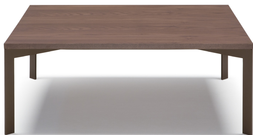
■ T042002XOF / T042002XDD