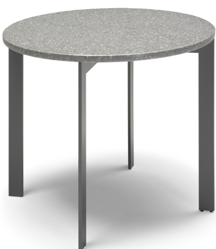
■ T042006XOF / T042006XDD