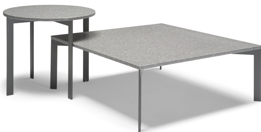
■ T042006XOF + T042003XOF / T042006XDD + T042003XDD