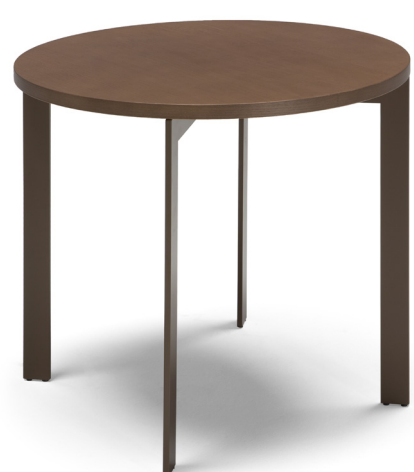
■ T042005XOF / T042005XDD