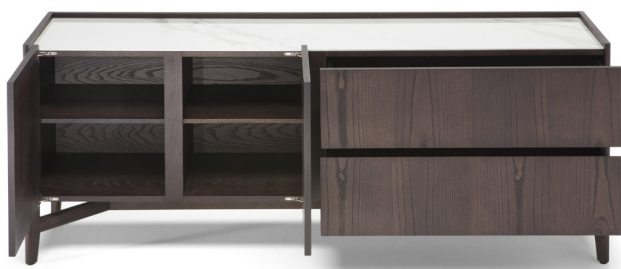
■ W22204X / W22207X