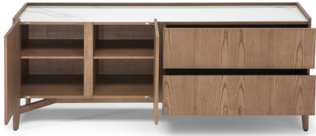
■ W22203X / W22206X