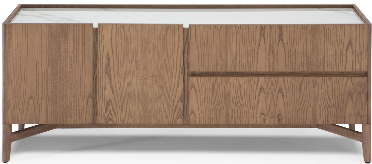
■ W22203X / W22206X

ALL PICTURES SHOWN ARE FOR ILLUSTRATIVE PURPOSE ONLY. ACTUAL PRODUCT MAY VARY DUE TO PRODUCT ENHANCEMENT.