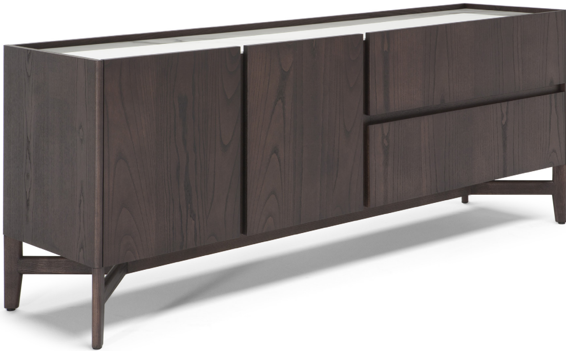
■ W22204X / W22207X