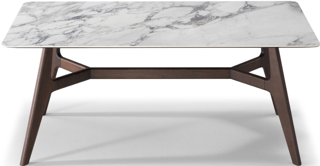
■ T22208X / T22214X

ALL PICTURES SHOWN ARE FOR ILLUSTRATIVE PURPOSE ONLY. ACTUAL PRODUCT MAY VARY DUE TO PRODUCT ENHANCEMENT.