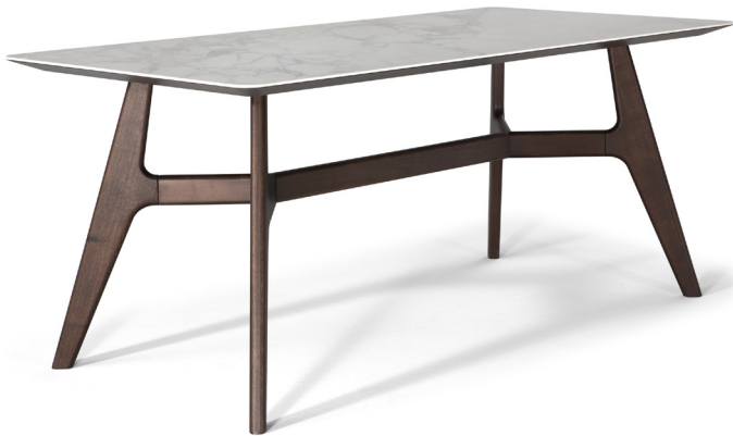
■ T22208X / T22214X