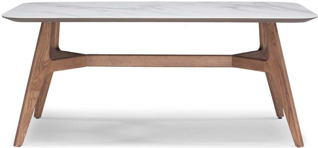
■ T22209X / T22215X