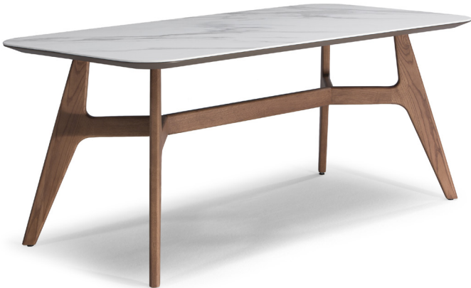
■ T22209X / T22215X